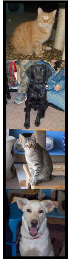
Available for adoption. From top: Gigi, Jackpot, Jamison, & Shiloh