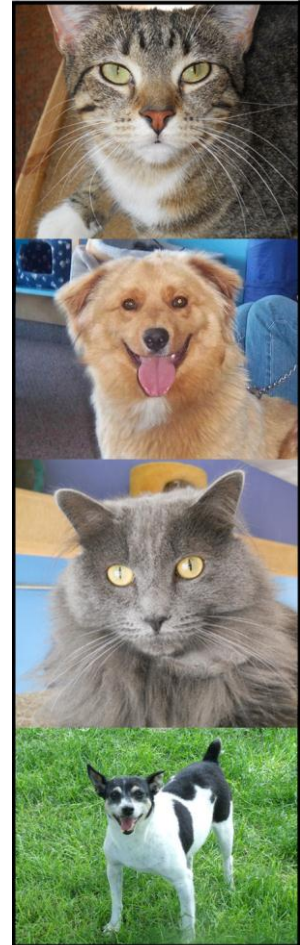
Available for adoption. From top: Bean, Puff Daddy, Liam, & Sonni