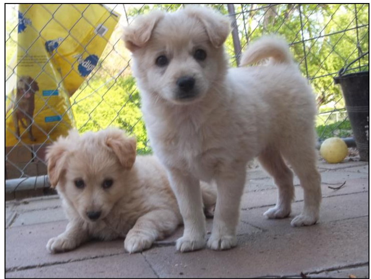
Tator & Tot

Be certain that your pets are safe during warmer outdoor temperatures. Always put out fresh, cool water. Clean the bucket or dish weekly so bacteria doesn't grow in the container. Make sure your dog can get into the shade. Don't leave your dog outside during hot weather. They will dig down until they hit cool dirt that will help lower their body temperature. Today the hole might barely scratch the surface, but they will continue to dig everyday to find cool dirt.