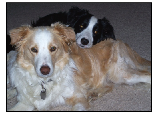
Parker (left) & Daisy (right)

"Parker is the perfect dog for our family and we thank the people at the Pierre shelter!"