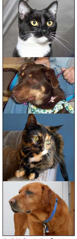
Available for adoption. From top: Aubergine, Lulu, Carmella, & Taco

Please help us raise money for the shelter by volunteering, attending the events and participating, and sharing the upcoming events with friends and family.