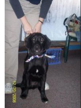
Charley Neutered male Black lab DOB: July 10, 2008