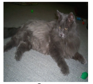
Grey Neutered male, Long-hair/dark gray DOB: Sept 4, 2003