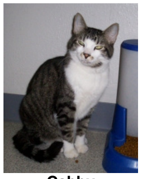
Cabby Neutered male Declawed Black/gray/white Tabby DOB: July 3, 2002