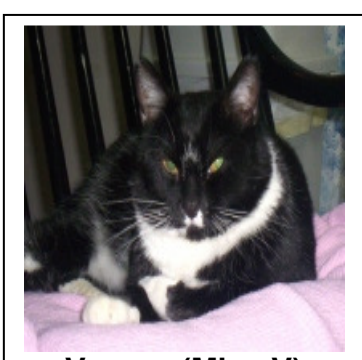
Veruca (Miss V) Spayed female Short tail DOB: July 2003