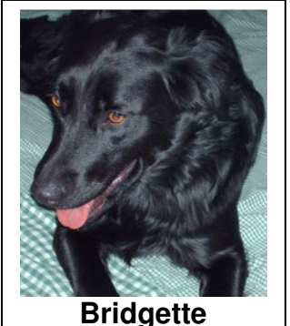
Female Black Lab Retriever Mix DOB: Jan 2, 2007