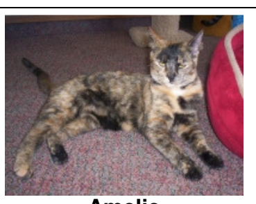
Amelie Spayed female Black/orange/tan Calico DOB: May 3, 2007

Visit <u>www.pets4adoption.org</u> for more detailed descriptions and to view the others looking for homes, as well!