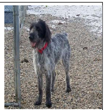
Major Neutered male German wirehair pointer Black/white DOB: Nov 5, 2006