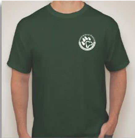
Forest green with white logo

All t-shirts are short-sleeved 50% cotton/50% poly.