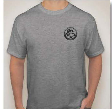
Oxford grey with black logo