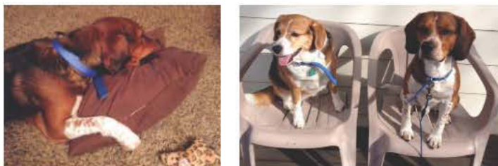
Left: Ollie loves to have a pillow to rest his head on. Right: Sam and Ollie enjoying some deck time.

"Ollie is doing great. Our existing Beagle took him right under her wing and they are best playmates and snuggle buddies."